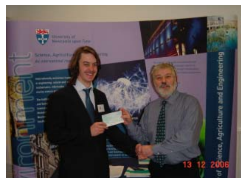
BSAS sponsor student conference at Newcastle see page 4, Recruitment.